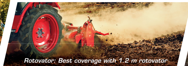
Rotovator: Best coverage with 1.2 m rotovator