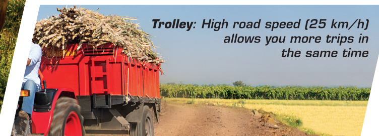
Trolley: High road speed (25 km/h) allows you more trips in the same time