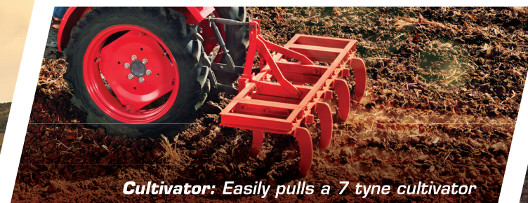
Cultivator: Easily pulls a 7 tyne cultivator