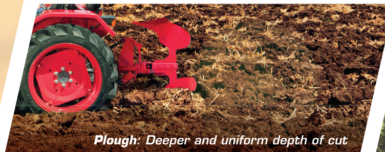
Plough: Deeper and uniform depth of cut